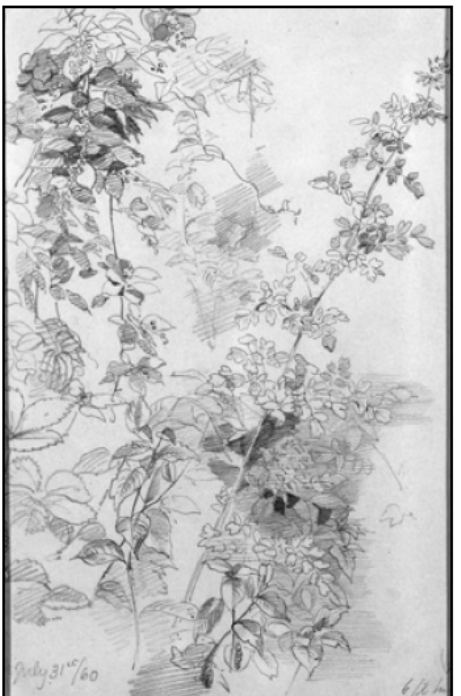
William Trost Richards, "Nature Study," 1860, pencil on green paper, 8 1 / 4 by 5 5 / 8 inches.

NEWPORT, R.I. — Since William Vareika Fine Arts first opened on Bellevue Avenue in Newport 23 years ago with a successful exhibition of the artworks of William Trost Richards, the gallery has earned a national reputation as one of the leading specialists in the work of this important American artist. During this time, Richards has become one of the most studied and sought-after artists of his generation and is today considered one of the leading American landscape and marine painters of the Nineteenth Century. William Vareika Fine Arts has been presenting a very popular on-going exhibition of works by William Trost Richards in one of the firm's three large exhibition rooms.