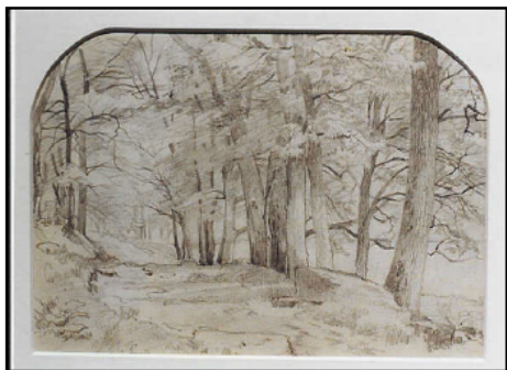
William Trost Richards, "Study for the Wissabickon," circa 1860, pencil on cream paper, 5 1 / 4 by 7 (arched top) inches.