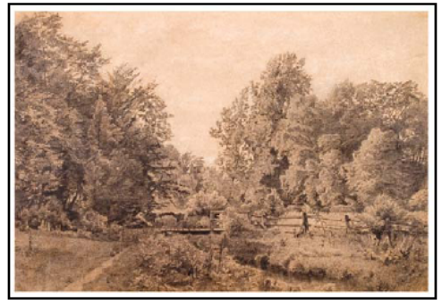
William Trost Richards, "Edge of Forest with Bridge over Stream," pencil on paper, 11 1 / 2 by 17 inches.